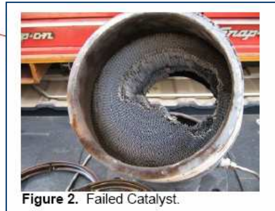
Figure 2. Failed Catalyst.