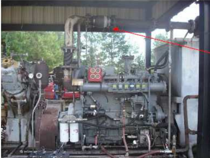
Figure 1. BP Findlay Compressor Station with Catalyst Installation.